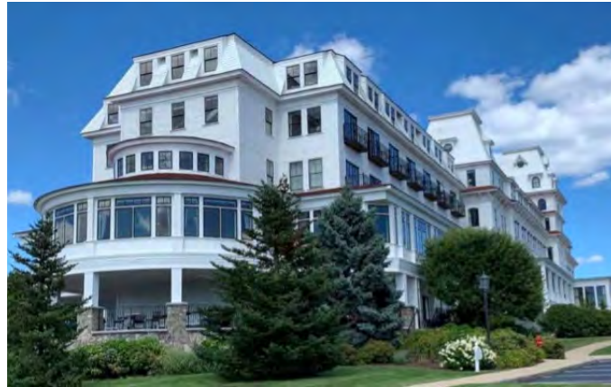
Wentworth by the Sea

On July 27 th , we will celebrate our 120 th Annual Meeting at the historic Wentworth-by-the-Sea in New Castle, NH. You'll find all the details about the meeting and how to register and pay your annual dues on our website at https://piscataquapioneers.org/donations-dues.html and on pages 2 - 4 of this newsletter.