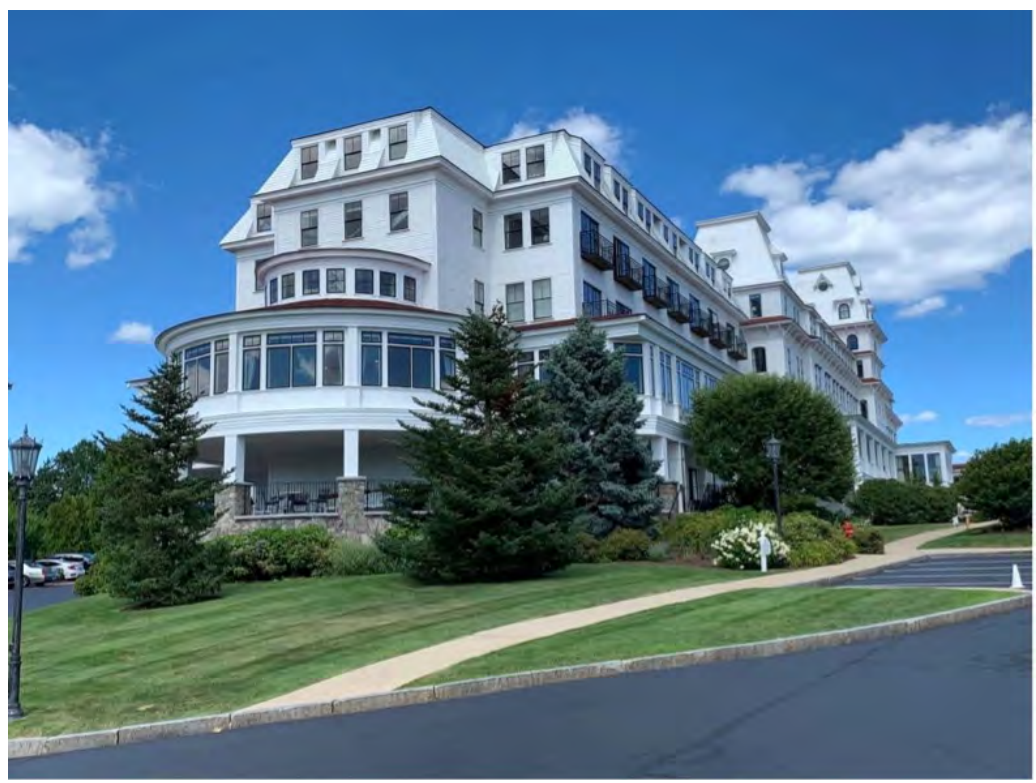
Wentworth by the Sea