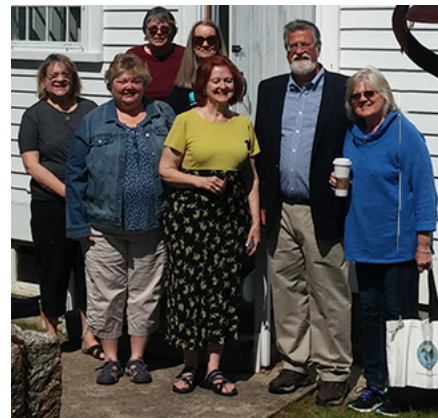
Council members at May 25, 2019 meeting.