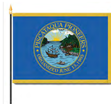
Janet Jackson Memorial Flag